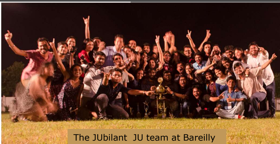
The JUbilant JU team at Bareilly